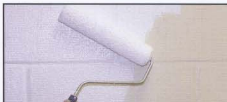
Acri-Pro 100 flat helps hide surface imperfections on masonry surfaces.