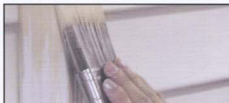
Acri-Pro 100 acrylic formula gives Acri-Pro 100 outstanding adhesion to previously painted surfaces.