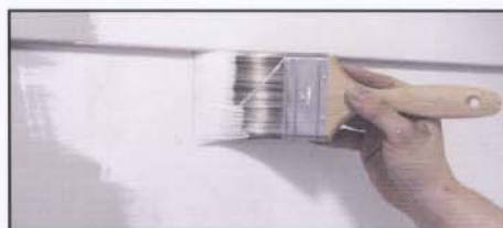
Acri-Pro 100 products feature a durable, yet breathable, paint film to resist cracking and blistering on wood siding.