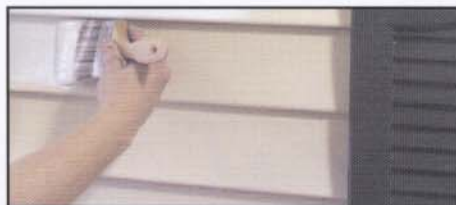
Acri-Pro 100 maintains its flexibility for long term protection on vinyl and aluminum siding.