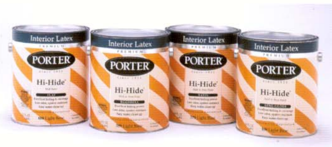
Available in flat, eggshell satin and semi-gloss. Ask your Porter Sales Representative for details.

HI-HIDE is Porter's family of high quality interior paint finishes for residential, institutional, and commercial use. HI-HIDE products are made with durable vinyl acrylic resins that withstand day-to-day wear even in high traffic areas. Painting professionals will appreciate the outstanding wet and dry hiding, coverage, and excellent touch-up ability. Do-it-yourself customers will admire the easy application, soap and water clean-up, and the rainbow of nearly 1200 beautiful DESIGN SPECTRUM® colors.