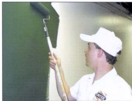
HI-HIDE Flat or Eggshell products offer outstanding hiding and application properties, and are ideal for walls in high traffic areas.