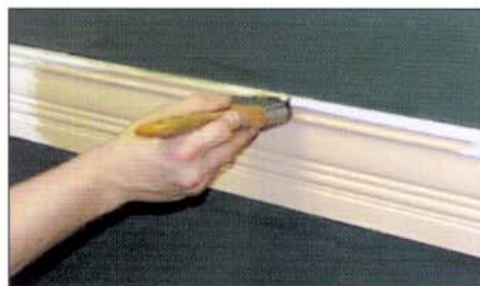
HI-HIDE Semi-Gloss provides excellent flow and leveling and is ideal for interior woodwork, doors, and trim.